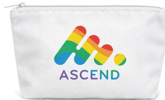
3. Rainbow Overlay Logo