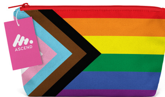
7. All Over Pride Flag