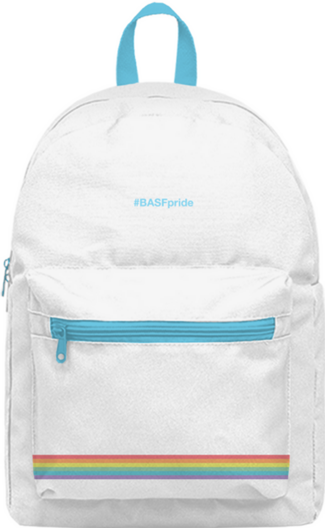
Recycled Canvas Backback