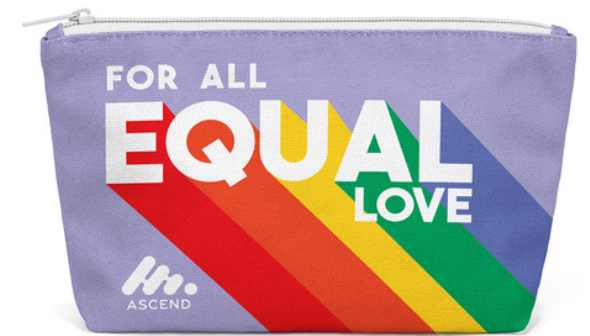
4. Pride Slogan