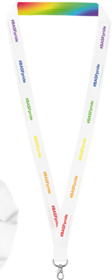
3/4" Dye Sublimated Lanyard