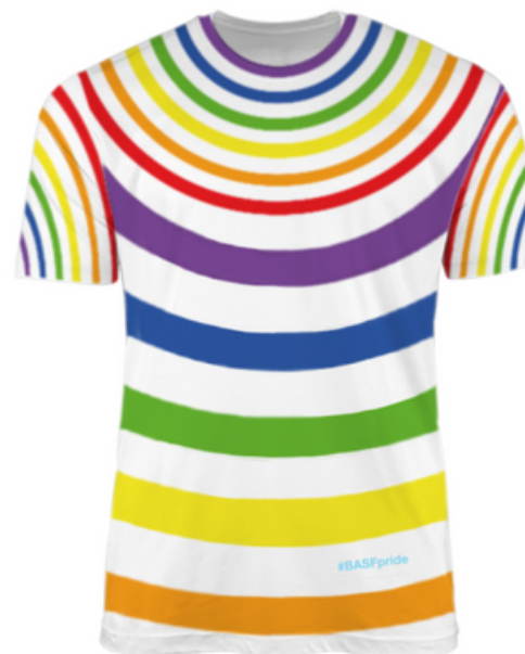
Full Color T-Shirt