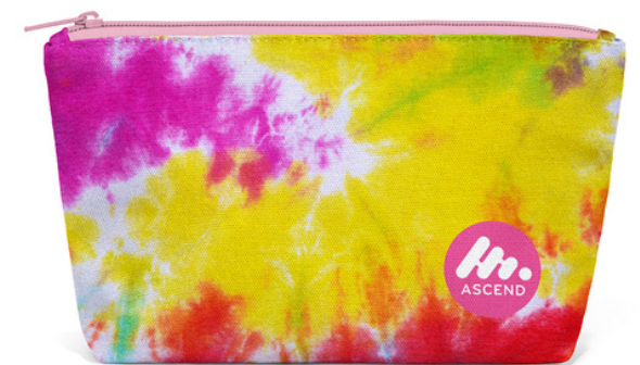
8. Rainbow Tie Dye