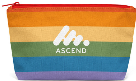
1. Pride Flag Background

Incorporating pride into your brand isn't just about adding a rainbow; it's about weaving the vibrancy of the LGBTQ+ community into the very fabric of your identity. Here are just a few creative ways to infuse pride into your brand: