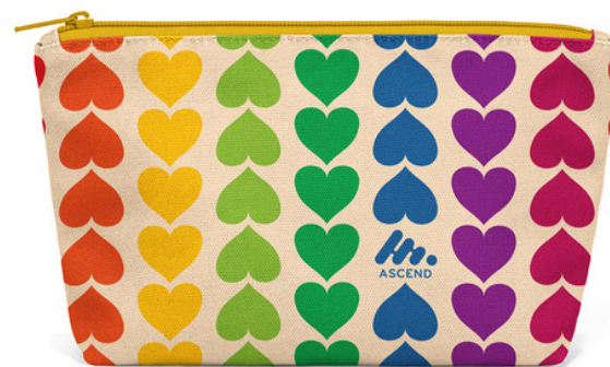
6. Rainbow Hearts