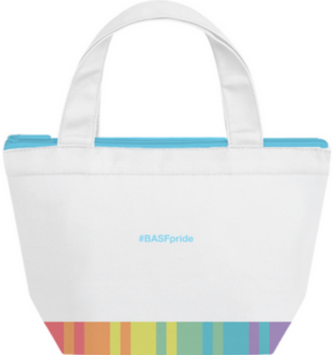
Small Recycled Canvas Lunch Cooler