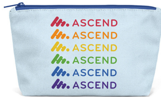
2. Rainbow Logo Row