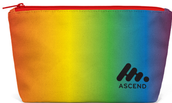
5. Rainbow Gradient