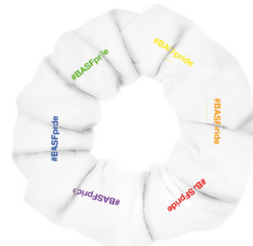
Full Color Scrunchie