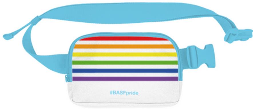
Recycled Canvas Cross Body Bag

Gear up for Pride Parades with custom, full-color printed merchandise that celebrates love, equality, and individuality - ensuring recipients stand out and show support in style!